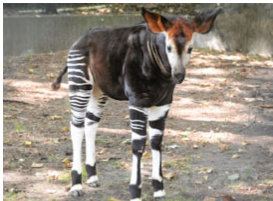
The Bronx Zoo's newborn okapi, M'bura

Today, that creature is no longer so elusive. In 2011, the staff of the Bronx Zoo in New York City celebrated the birth of one, named M'bura. As she galloped around her shady enclosure, visitors marveled at the unusual animal with big, upright ears like those of a donkey, stripes like those of a zebra, and the silhouette of an antelope.